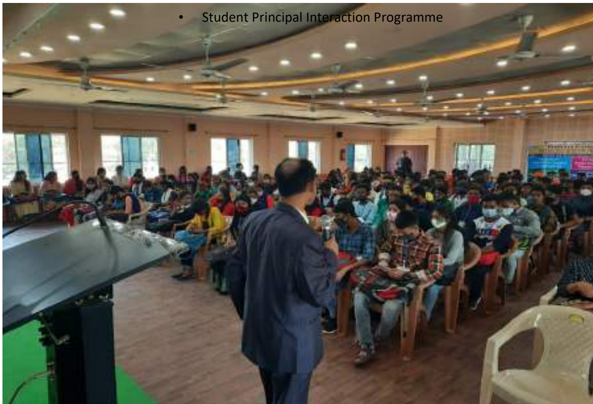
• Student Principal Interaction Programme

An Interaction Programme between the Principal and the students of Political Science, Dinhata College was held on 9 th December 2021. The entire programme was organized by the Department of Political Science. Principal addressed the programme with his valuable experiences, illuminating thoughts and motivating attitudes. The sole objective of the programme was to provide the opportunity to the students to directly interact with the Principal of the College and to share their problems, observations and arguments regarding their experiences in the college. More than 200 hundred students have participated in the programme.