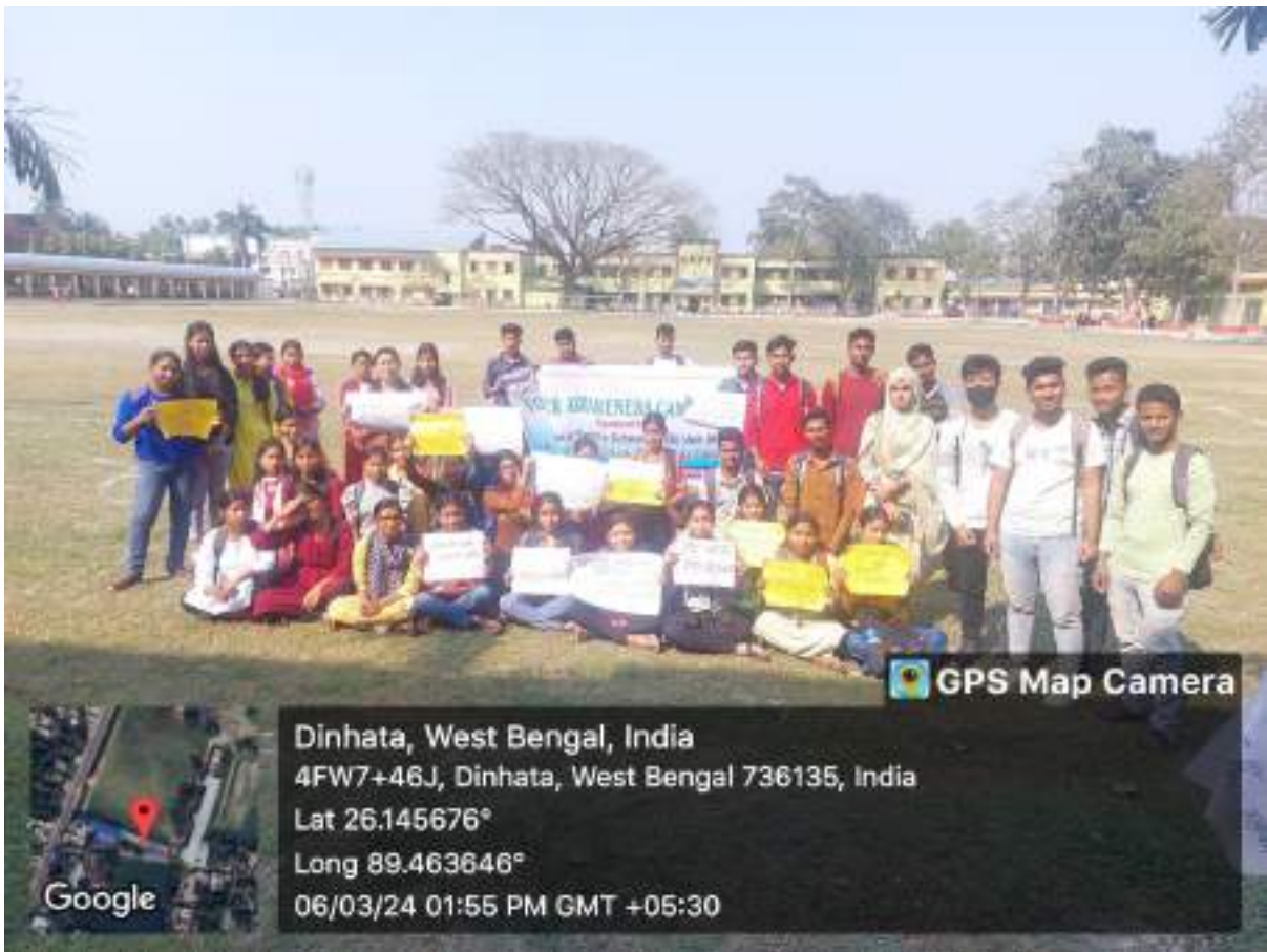
Voters Awareness Campaign 2024