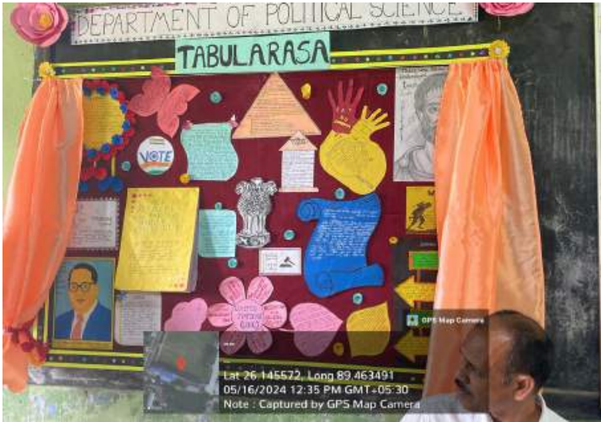
Wall Magazine 2024