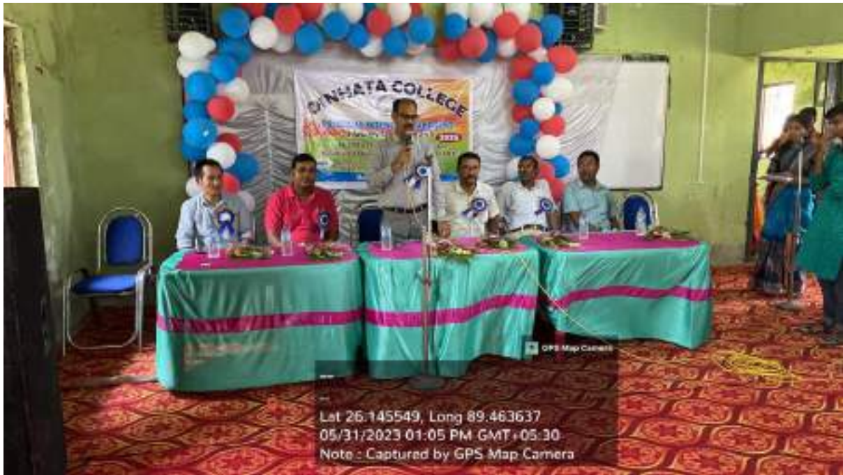
Orientation Programme 2023